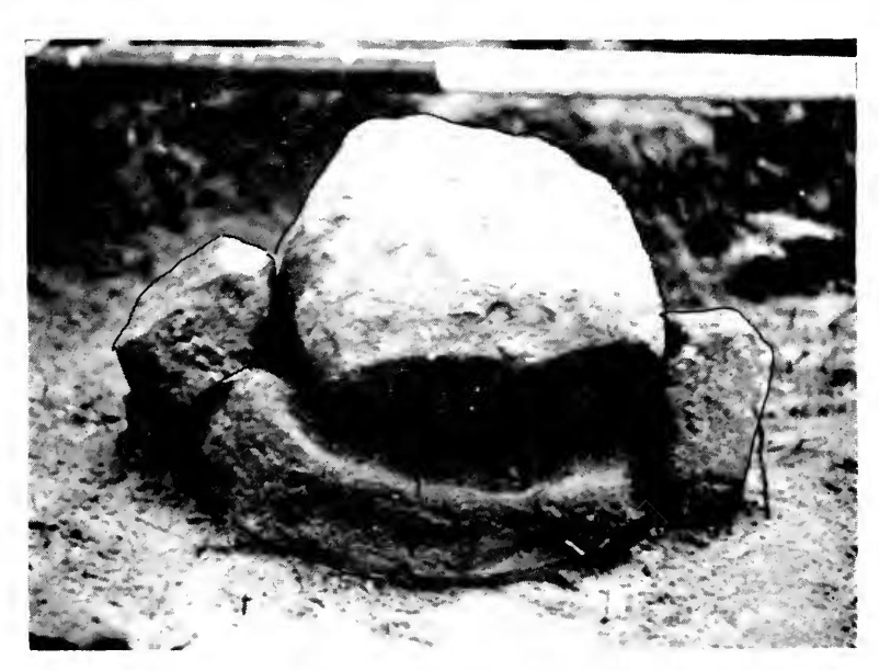
(b) Weston Wood: Quern,