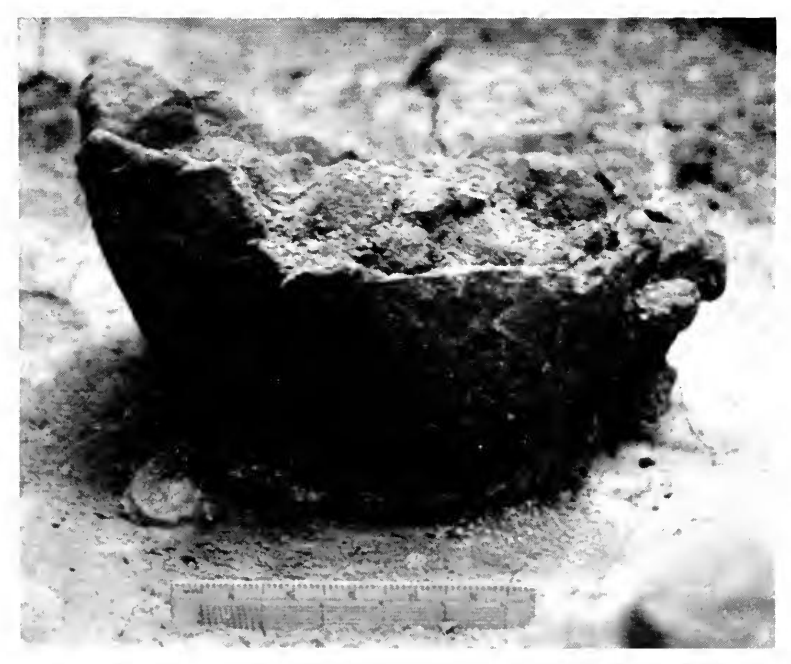
(b) Weston Wood: Storage Pot. C8.