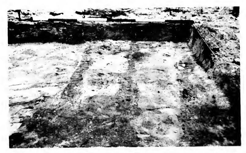
(a) Weston Wood: Furrows. D4.