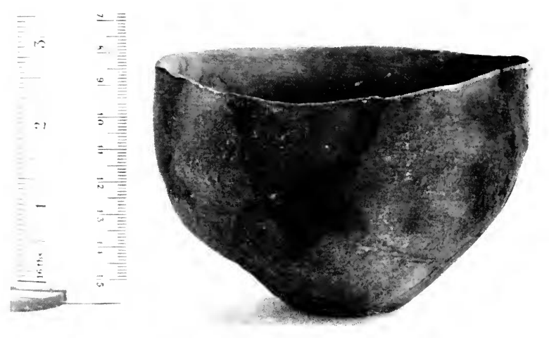
(a) Weston Wood: Burnished Bowl. C9.